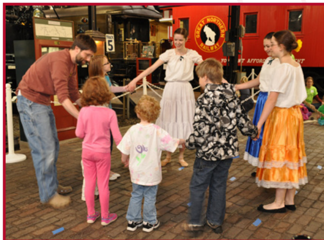
Attendees learn the Cumbia from MN Ballet dancers