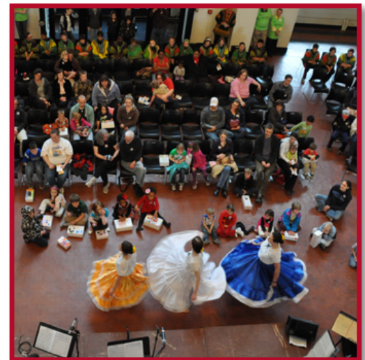
MN Ballet dancers perform the Cumbia with DSSO musicians