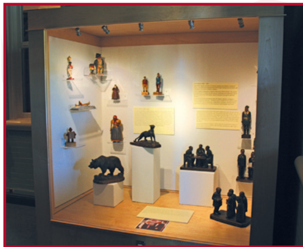
St. Louis County Historical Society: Priley Woodcarving Collection Exhibit Display Case