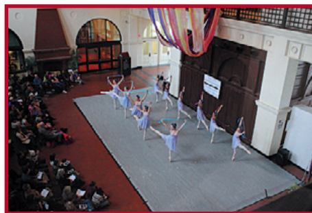
Minnesota Ballet: Dance Day at the Depot