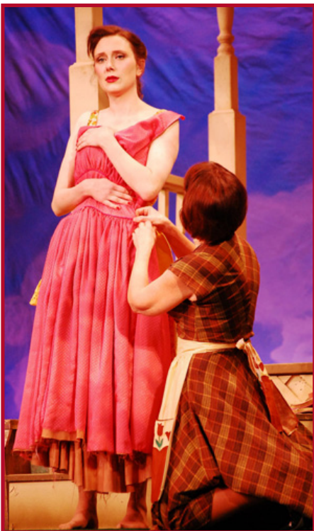
Duluth Playhouse: production support for 2010-2011: Picnic