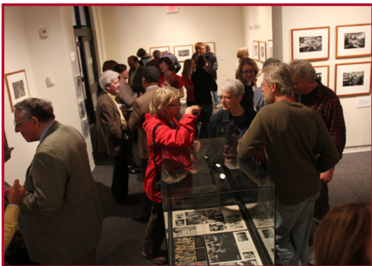
Duluth Art Institute: Northland Women in the Art of Advertising (featuring Esther Bubley)